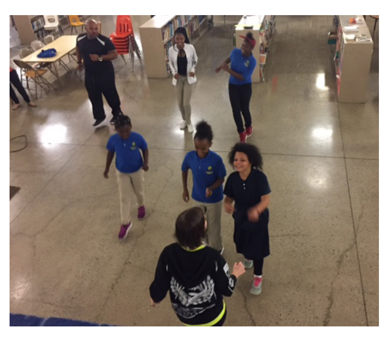
Zumba class held in a school library.

Evaluation does not have to be complicated, but it will be good to have ideas around how you will evaluate your promotions to identify success as well as things that could be changed or improved. This can be as simple as asking participants how they heard about the program so you can track which strategies have been most successful, and eliminate or change any strategies that have reached very few people.