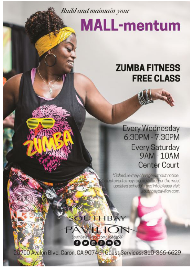
Examples of flyers promoting shared use programs