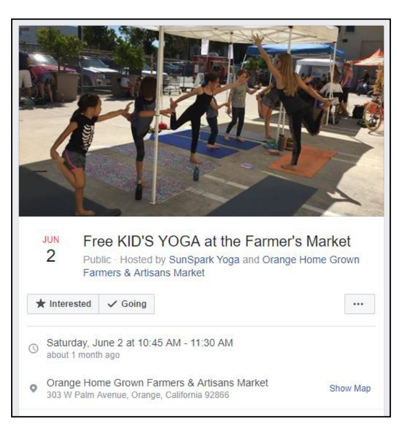
Event listings on Facebook are free and allow community members to RSVP or indicate interest in the event.

Provide information on your organization or facilities website. But more importantly, find out what websites your community or audience uses and post information there. Be sure to keep the information up to date.