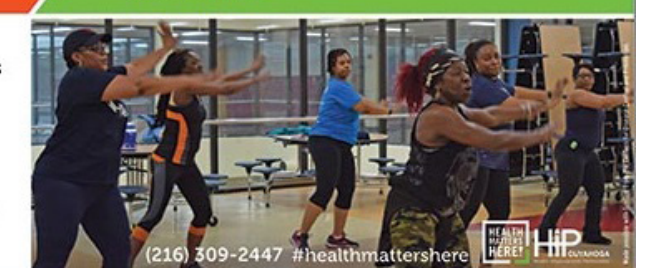
Example bus ad