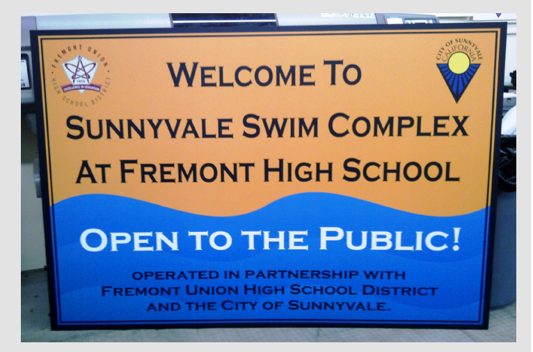
Sign outside an open use facility

If you are opening up your facility for open use (i.e. a school playground on weekends and in the evenings), you will likely want to use one or more of the strategies described in this section to get the word out, in addition to providing signage on your facility that is visible to the public. Signage should be welcoming and make it clear when the facility is open to the public.