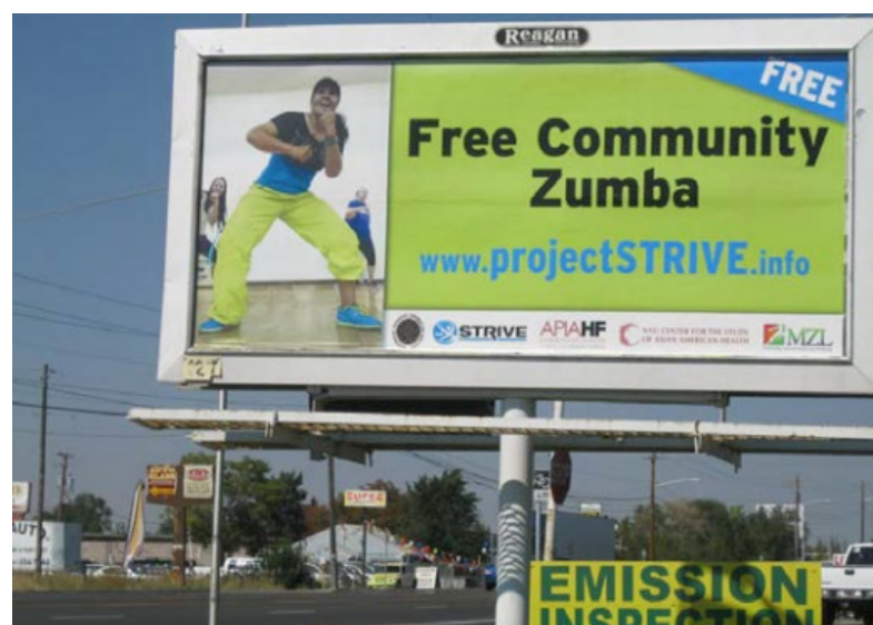
Examples of large billboards